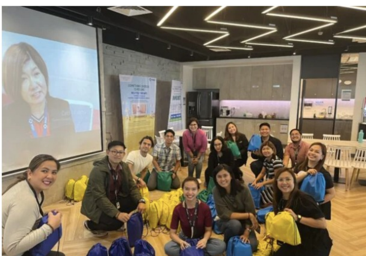
MSD Gives Back! Employee volunteers prepare wellness kits for The Carewell Community